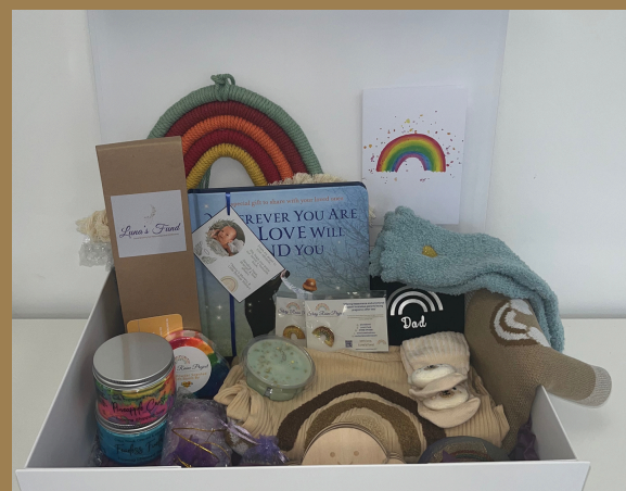
Pregnancy After Loss