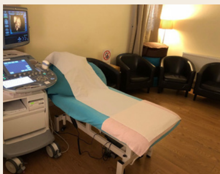
Ultrasound Direct Plymouth

Together, we can ensure no parent walks this path alone.