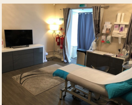
Ultrasound Direct Exeter