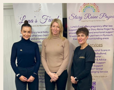
The Baby Skan Studio Truro