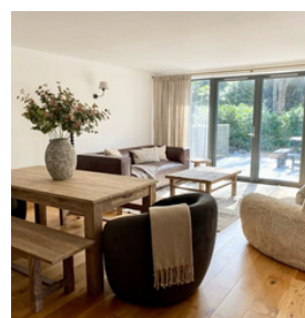
Emerald Eco Lodges

Award winning, self catering waterside cabin retreat.