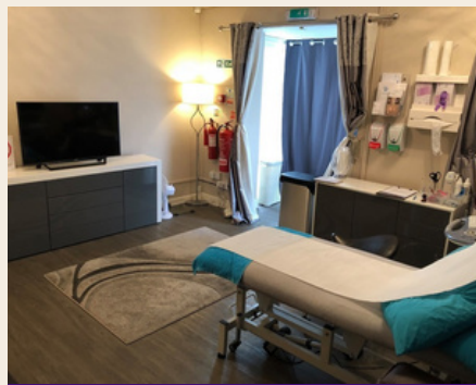
Ultrasound Direct, Plymouth & Exeter