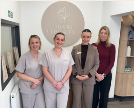
Bloom Ultrasound, Torbay

Together, we can ensure no parent walks this path alone.