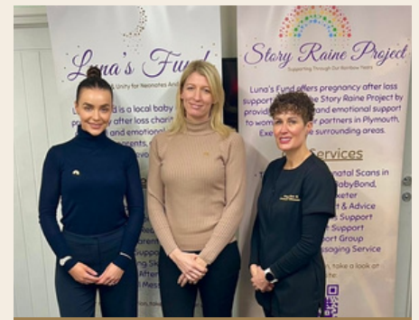
The Baby Skan Studio, Truro